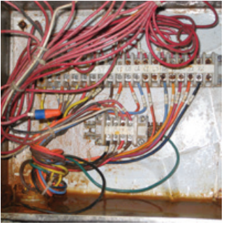
Water accumulation in electrical