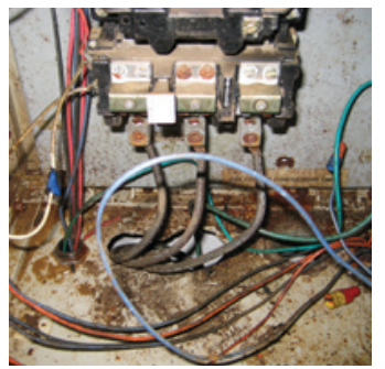
Corrosion leads to premature component failure